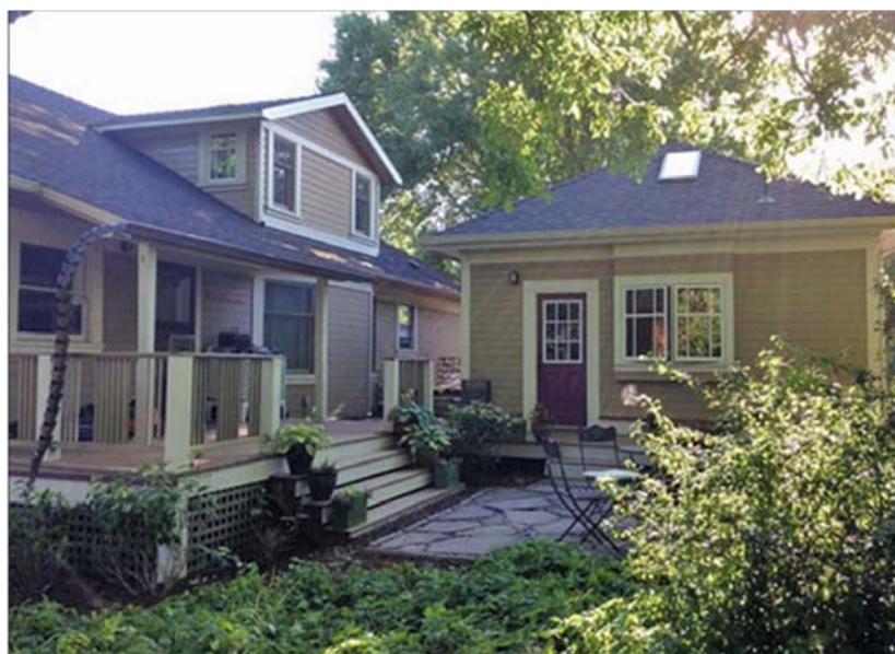
M. Klepinger's backyard detached ADU, Richmond neighborhood, Portland, OR.

OREGON DEPARTMENT OF LAND CONSERVATION AND DEVELOPMENT